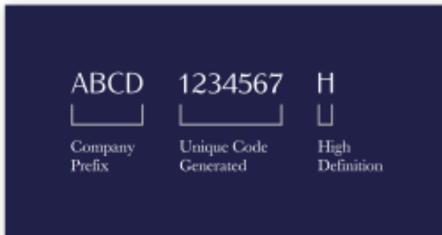
Figure 4 Ad-ID Structure

There are currently over 700 advertisers signed up for Ad-ID, including over 74 of the top 100 advertisers in the US, with new users coming onboard regularly. Ad-ID is an advertiser pays model and there is no cost for the use of its web services.