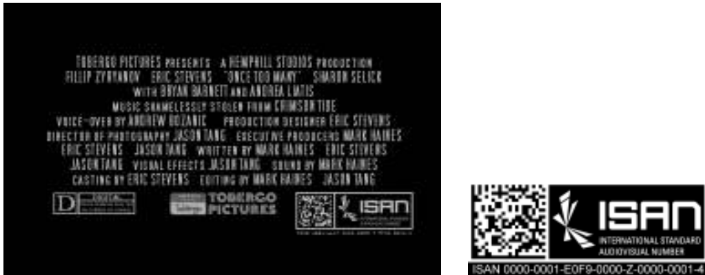
Figure 1 Illustration of an ISAN in use

ISO spent over 10 years developing the ISAN content identification standard with contributions and feedback from dozens of media companies, producers, collection societies, broadcasters, and standards organizations. ISO 15706-1, published in 2002, forms the foundation of the ISAN identification and numbering system, enabling audiovisual work identification on the production level. The ISAN standard was extended in 2007 with the publication of ISO 15706-2, which is a 96-bit identifier that supports the identification of versions of a production. Today, the two ISAN standards describe a complete numbering system for the identification of productions as well as versions of those productions across languages, picture cuts, and regional broadcasters.