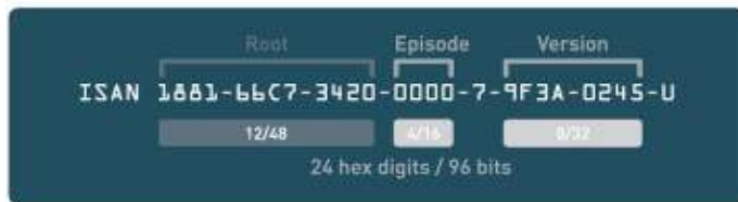
Figure 2 ISAN Structure

ISO spent over 10 years developing the ISAN content identification standard with contributions and feedback from dozens of media companies, producers, collection societies, broadcasters, and standards organizations. ISO 15706-1, published in 2002, forms the foundation of the ISAN identification and numbering system, enabling audiovisual work identification on the production level. The ISAN standard was extended in 2007 with the publication of ISO 15706-2, which is a 96-bit identifier that supports the identification of versions of a production. Today, the two ISAN standards describe a complete numbering system for the identification of productions as well as versions of those productions across languages, picture cuts, and regional broadcasters.